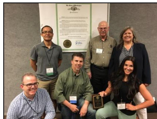
April 17, 2019, was declared Environmental Health Specialist Day, in recognition of all the important work performed that impacts the lives of Washington state residents. A copy of the resolution was displayed at the AEC. The photo shows some of Thurston County's employees who make a difference in environmental health.