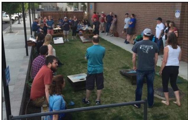
The inaugural AEC cornhole tournament..... rematch, anyone?

To register or find out more information, visit www.wseha.org/haccp . Classes are filling up fast!