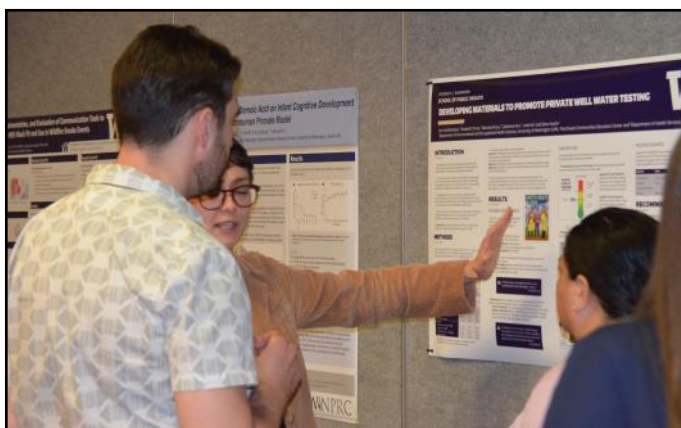
The Monday night social & poster session went swimmingly! There were a large variety of topics and presenters who knew their stuff.

Pictures and presentations are available at the post-AEC website ! If you haven't already, be sure to complete the evaluation that's available at the website. We need and appreciate your feedback!