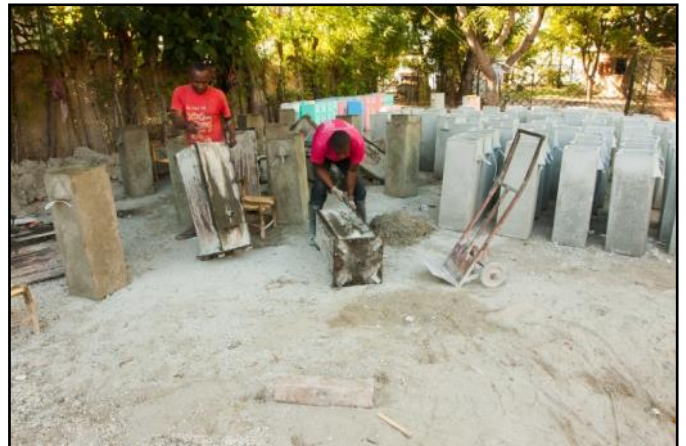
Clean Water for Haiti, 2024 IHC Recipient (see page 4 for information)